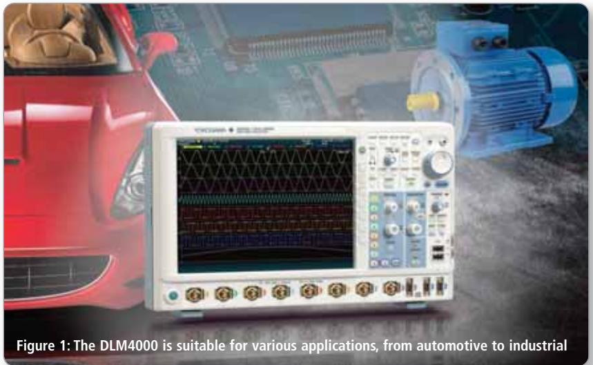
Figure 1: The DLM4000 is suitable for various applications, from automotive to industrial

“We develop motor control systems, and we typically need to look at three